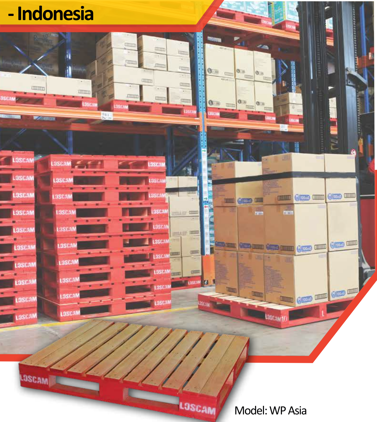
Model: WP Asia