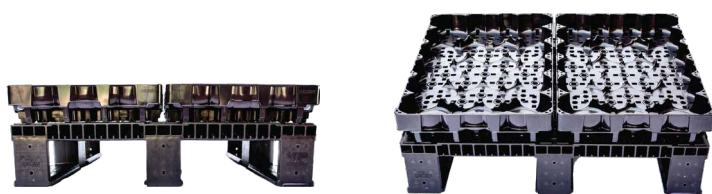
Beverage Trays on Display Pallet