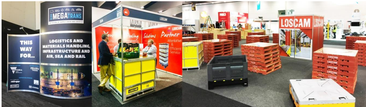
Product displays and demonstrations